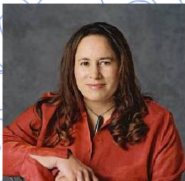
Ngati Kahungunu (Tangoio), Whakatohea (Opape), Ngati Raukawa (Ngatokowaru)