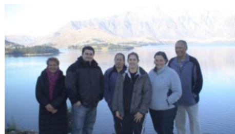
The team in Queenstown at the 2012 retreat... beautiful part of NZ