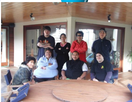
Staff and whanau at the Taupo Lake retreat (above) – and again, doing our planning (below)