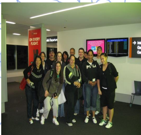
The team off to Sydney in 2009 (planning retreat of course) – and to see Beyonce!