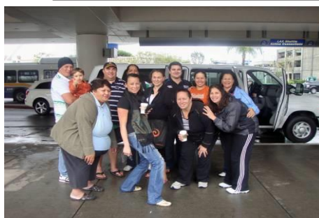
STRIKE A POSE – again! In LAX