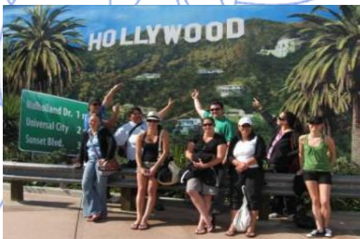
The team in Los Angeles (can you tell?)