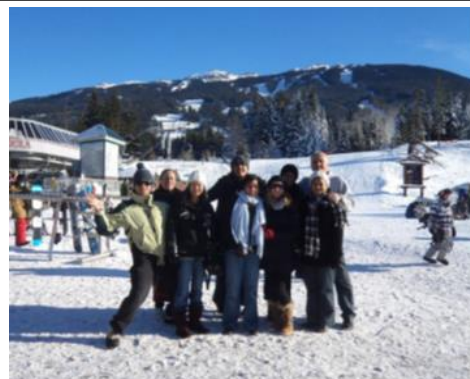
The team in Whistler Canada (don't you know Maoris can't ski LOL)