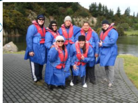
The team jet-boating rafting in Taupo (or at least dressed like they are)