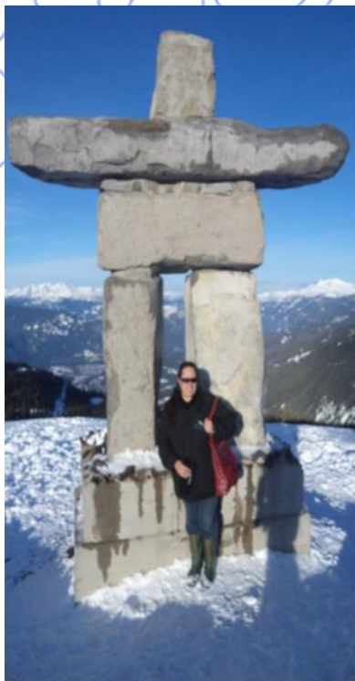
Me at the Inukshuk monument atop Whistler mountain. It is a marker & wayfinder.....works for me!

political leaders like Hon. Tariana Turia (Tariana we will be forever grateful for what you did for us), Meka Whaitiri (who did us proud in Parliament by welcoming our Canadian First Nations visitors from her parliamentary seat in 2013); and the late Parekura Horomia- all of whom have in their way helped me personally as well as Kahui Tautoko.