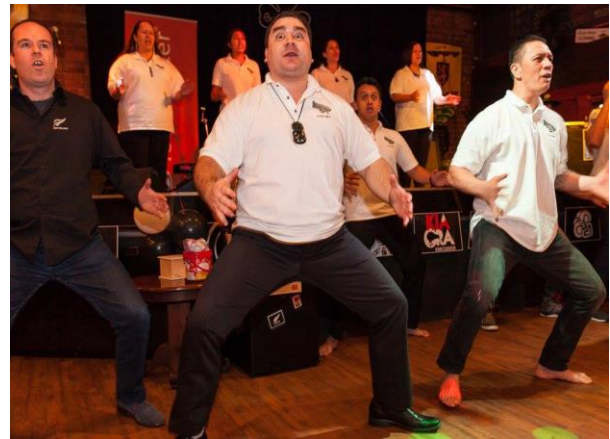
Washington DC March 2016: Performances at the Smithsonian Museum in Washington DC to launch a NZ movie appearing in an international film festival. Also showing support to the American consulate based in Washington DC.