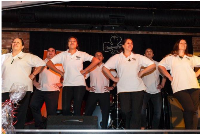
Waitangi Day and ANZAC celebrations in Vancouver 2016